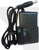
x1 Power Plug