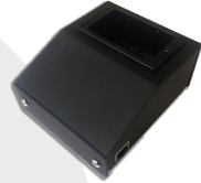
1x B-cam Single Dock