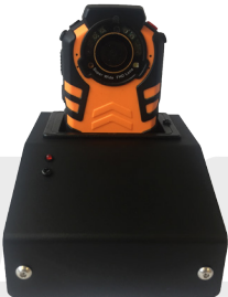
B-Cam Compact mounted in dock

To upload, mount the B-Cam Compact as shown.